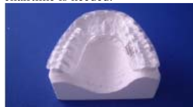
Hard Acrylic Splint

3. Hard Acrylic – are economic and durable, but may be harder to fit in the mouth than other materials because there is no internal give. Anterior guidance and disclusion can be added easily. Ball clasps are often needed to provide sufficient retention. It is also harder to adjust so more chairtime is needed.