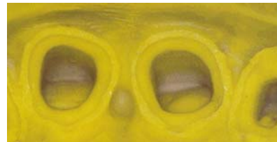
Detailed, Accurate Impression

also cause a lack of impression detail. Be sure to follow manufacturer's working time specifications, or choose a material with a longer working time. If your impression material is too warm the working time will be reduced, so watch where the material is stored. In order to avoid unfavorable interactions between the retraction or hemostatic materials and the impression material, rinse well with water & dry before taking the impression. Lastly, the completed impression needs to be stored correctly until it can be poured up at the laboratory. Rinse polyether impressions with water and blow dry before sending to the lab. Do not send the impression in the same bag as an alginate impression. Avoid storing impressions in sealed bags, and keep it away from direct sunlight – at room temperature.